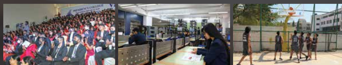
Auditorium Library Basketball Court