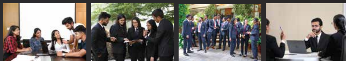
Soft Skill Training Aptitude Training Internship Support Placement Support