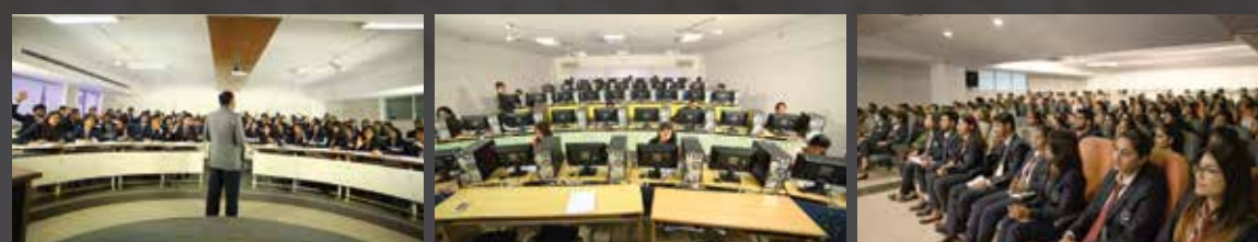
ICT enabled classrooms Laboratories Seminar Hall