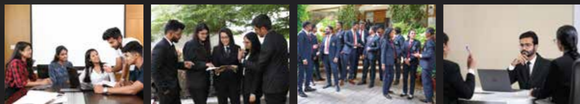
Soft Skill Training Aptitude Training Internship Support Placement Support