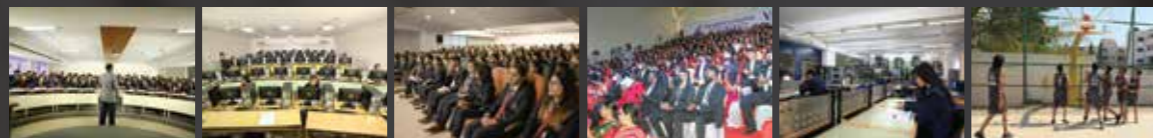
ICT enabled classrooms Laboratories Seminar Hall Auditorium Library Basketball Court