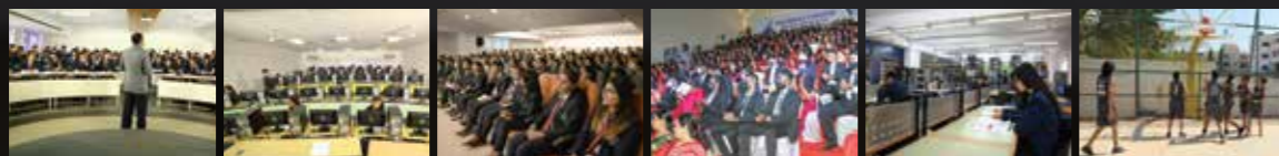
ICT enabled classrooms Laboratories Seminar Hall Auditorium Library Basketball Court