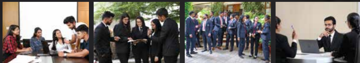
Soft Skill Training Aptitude Training Internship Support Placement Support