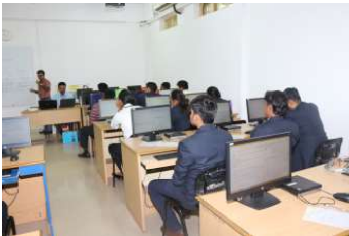
Students having hands on session