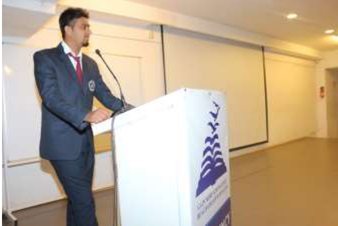
Student giving feedback during valedictory