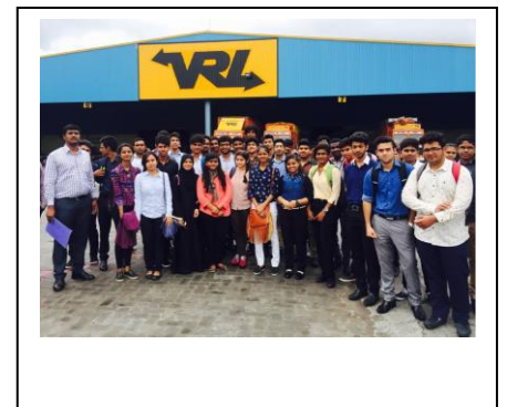
I BBA C