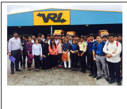
I BBA A